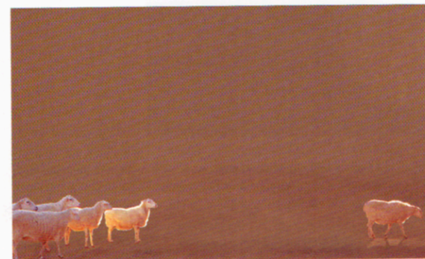
Figure 7.11 Allison Hunter used a 35mm SLR to photograph sheep at the Houston Zoo. She then scanned her negatives and digitally manipulated the composite image to remove the background and draw out a monochromatic palette. Hunter explains her process: "I am interested in making people think about how they perceive and respond to the elements of the world around them that are often marginalized or overlooked. I approach this problem in my artwork by taking things out of context to show their beauty, grace, and uniqueness. My effort is not to add but to remove elements from the original image to allow the viewer to focus more intently on the process of displacement and reinterpretation."

© Andrew Phelps. Baghdad Suite 03 , 2008. 20 x 24 inches. Chromogenic color print.